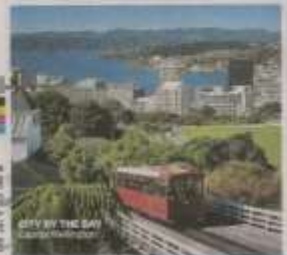
CITY BY THE SEA A scenic view of a coastal town with a harbor.

10 MAJORCA From £2,937 for three nights for two adults and two children. The five-star Hotel de Ville is a great all-inclusive option for families. There are five restaurants, five bars, tennis and a cinema. The children's club, including the arcade for toddlers, is part of the package. The hotel has two pools and themed parties, a 24-hour cinema with water slides and a two-hour outdoor pool. There are plenty of excellent family entertainment in the evenings.