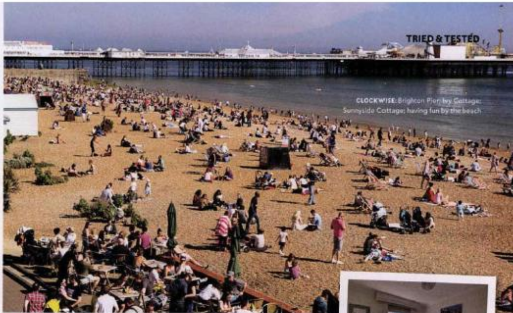
CLOCKWISE: Brighton Pier; Ivy Cottage; Sunnyside Cottage; having fun by the beach