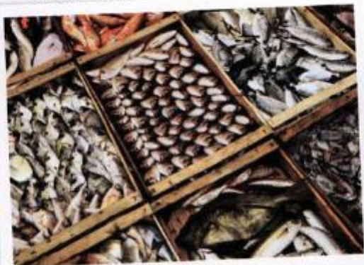
FROM LEFT: Catch of the day; Halkidiki