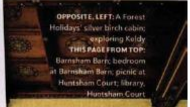
OPPOSITE, LEFT: A Forest Holidays' silver birch cabin; exploring Keldy THIS PAGE FROM TOP: Barsham Barns; bedroom at Barsham Barns; picnic at Huntsham Court; library, Huntsham Court